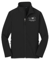
Port Authority Youth Core Soft Shell Jacket