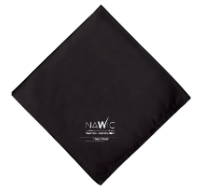
Big Accessories Solid Bandana