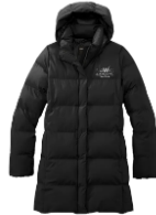
Mercer+Mettle Women's Puffy Parka