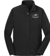
Port Authority Core Soft Shell Jacket