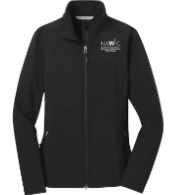
Port Authority Ladies Core Soft Shell Jacket