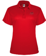
Badger C2 Women's Polo