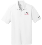
Nike Dri-FIT Vertical Mesh Polo