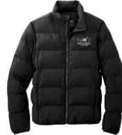
Mercer+Mettle Puffy Jacket