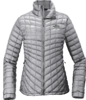
The North Face Ladies ThermoBall Trekker Jacket