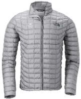
The North Face ThermoBall Trekker Jacket