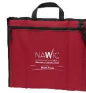
Port Authority Stadium Seat