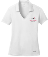
Nike Golf Ladies Dri-FIT Vertical Mesh Polo