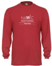
Badger B-Core Long Sleeve Tee