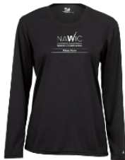
Badger B-Core Ladies Long Sleeve Tee