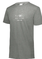
Augusta Tri-Blend T-Shirt