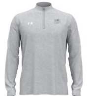
Under Armour Men's Team Tech Long Sleeve 1/4 Zip