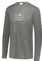
Augusta Tri-Blend Long Sleeve Crew