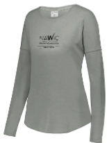
Augusta Ladies Lux Tri-Blend Long Sleeve Shirt