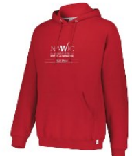
Russell Dri-Power Fleece Hoodie