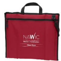
Port Authority Stadium Seat