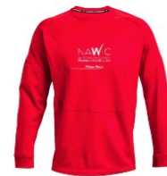
Under Armour Men's Armour Fleece Storm Crew