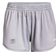
Under Armour Women's 3.5" Knit Shorts