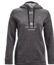
Under Armour Women's Hustle Fleece Hoody