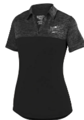
Augusta Ladies Shadow Tonal Heather Polo