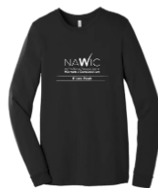
BELLA+CANVAS® Unisex Jersey Long Sleeve Tee