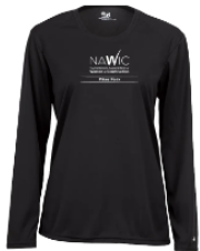
Badger B-Core Ladies Long Sleeve Tee $29.95