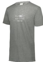
Augusta Tri-Blend T-Shirt $25.95