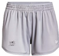
Under Armour Women's 3.5" Knit Shorts $42.95