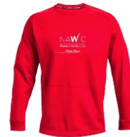
Under Armour Men's Armour Fleece Storm Crew $60.95