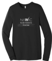
BELLA+CANVAS® Unisex Jersey Long Sleeve Tee $28.95