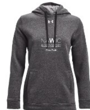
Under Armour Women's Hustle Fleece Hoody $63.95