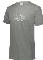
Augusta Tri-Blend T-Shirt