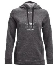
Under Armour Women's Hustle Fleece Hoody