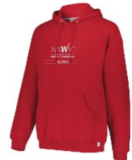
Russell Dri-Power Fleece Hoodie