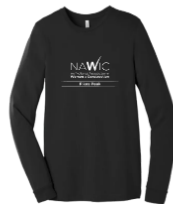
BELLA+CANVAS® Unisex Jersey Long Sleeve Tee