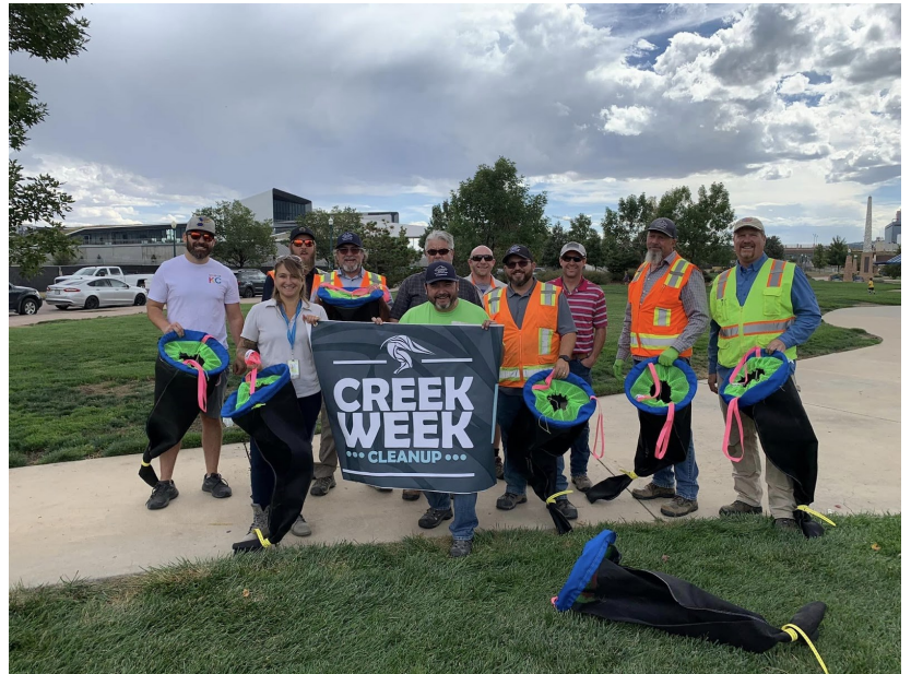
City of Colorado Springs Stormwater Enterprise