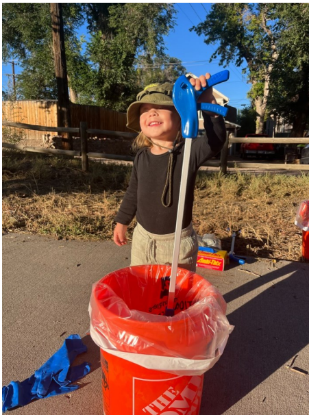
Aprivida Cleanup Crew 2022