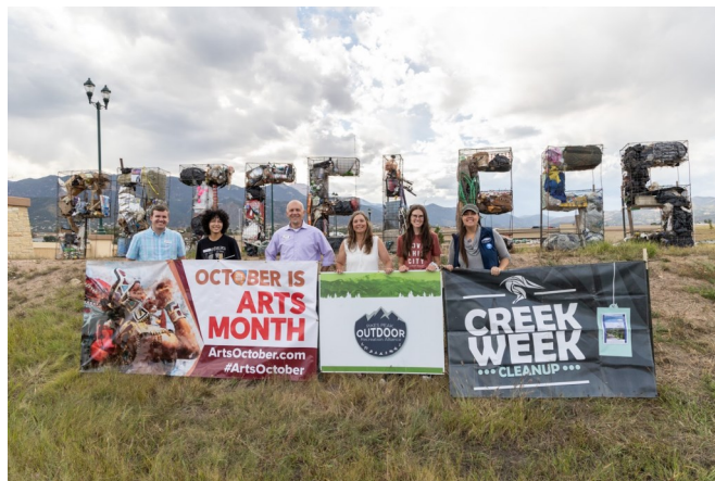
Litter Letter Dedication 2022