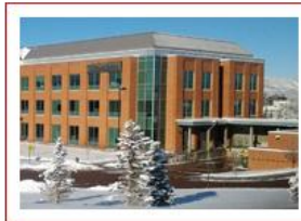
T Rowe Price