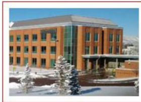
T Rowe Price